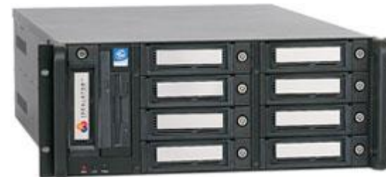
8 Bay WORM – BW4U-8E