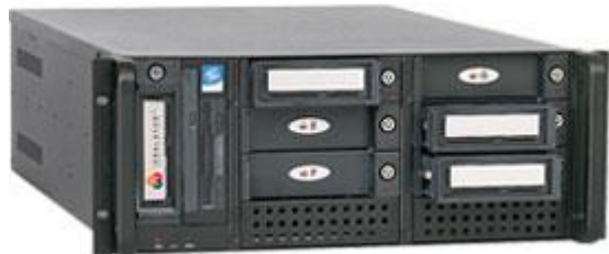
Idealstor 6 Bay – BA4U-6E