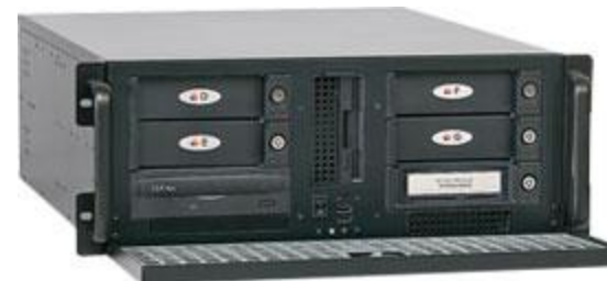
4 Bay WORM – BW4U-4E