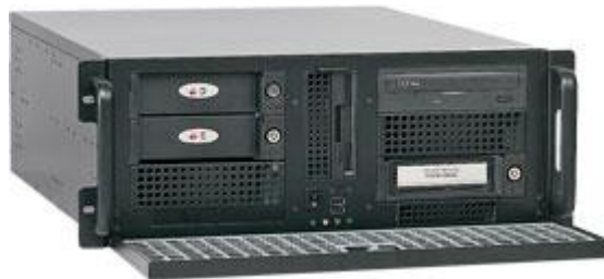
2 Bay WORM – BW4U-2E