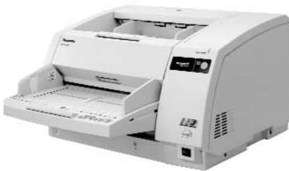
Panasonic's new KV-S3065C brings high-speed color capabilities to the proven design of its KV-S2065 model.

"In the document scanner industry, CIS configurations have traditionally used CMOS (complementary metal oxide semiconductor) cameras with LED