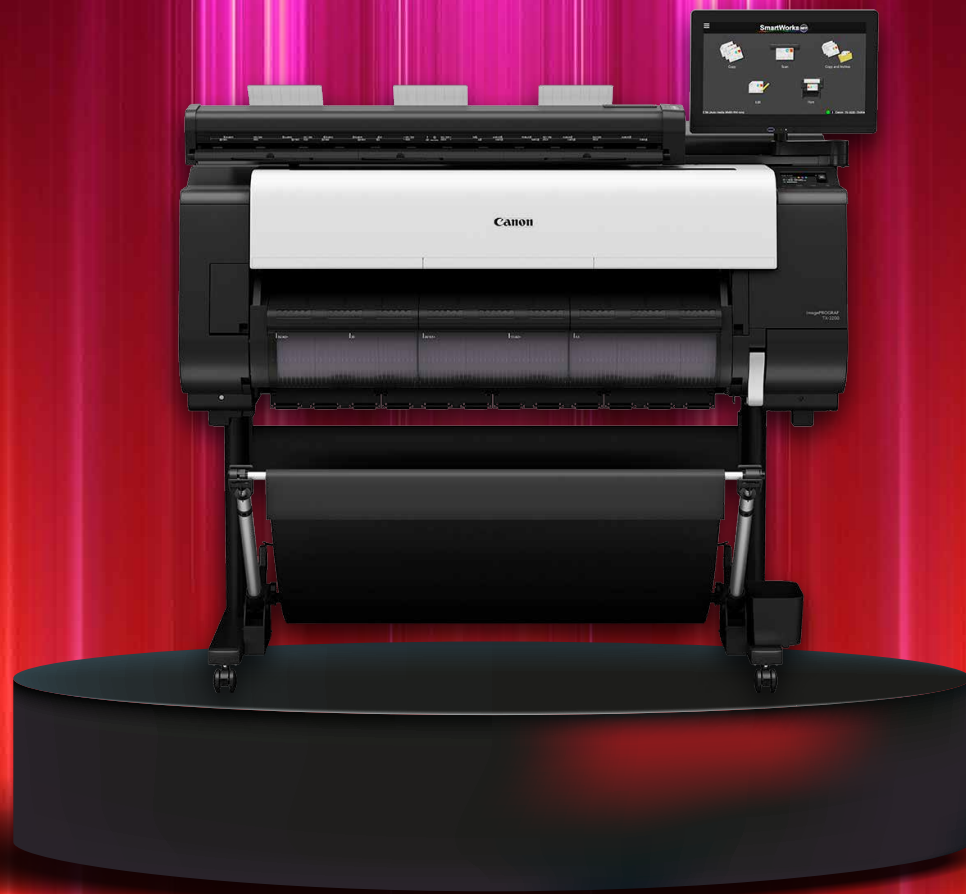
imagePROGRAF TX-3200 MFP Z36